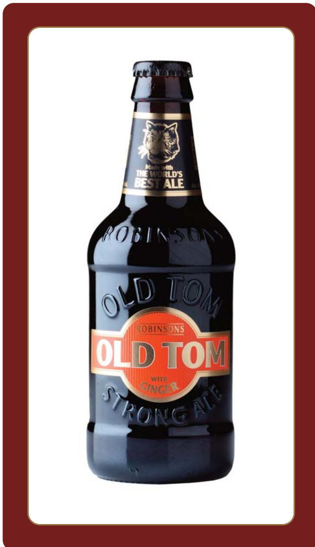
Packaging format: 330ml NRB