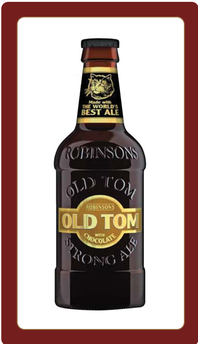
Packaging format: 330ml NRB